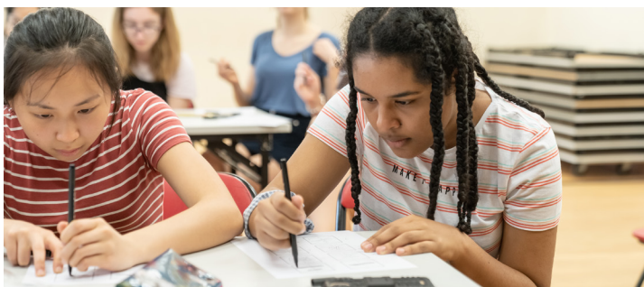
British students learning Chinese calligraphy--perfect cultural mix