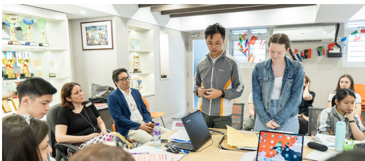
G.T. and Invicta students presenting in the mini U.N. Forum