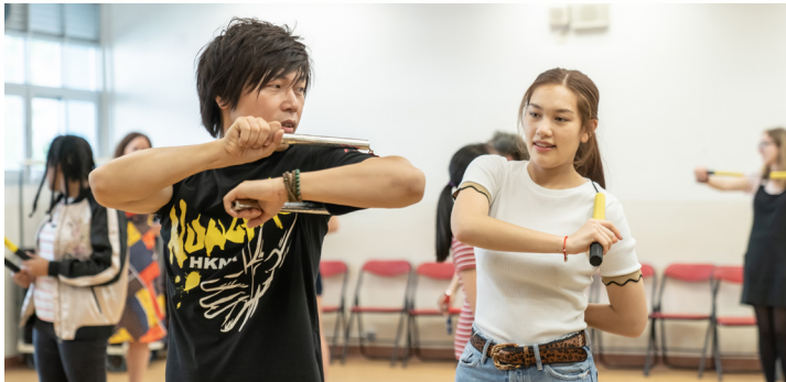
Invicta girls aspiring to become Bruce Lee by practising nunchaku

After the Invicta students arrived at our school, they were greeted with the enthusiasm and hospitality that our students received when they were in the UK. Our series of exchanges began with a United Nations Forum which worked towards a resolution dedicated to solving environmental issues. The Invicta students then had a taste of Chinese culture by practising Chinese calligraphy and nunchaku.