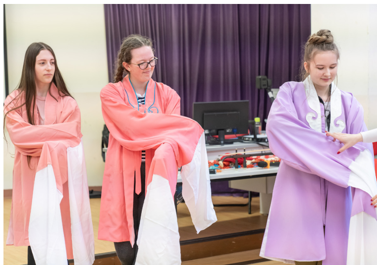
Dancing like butterflies with Cantonese opera costumes