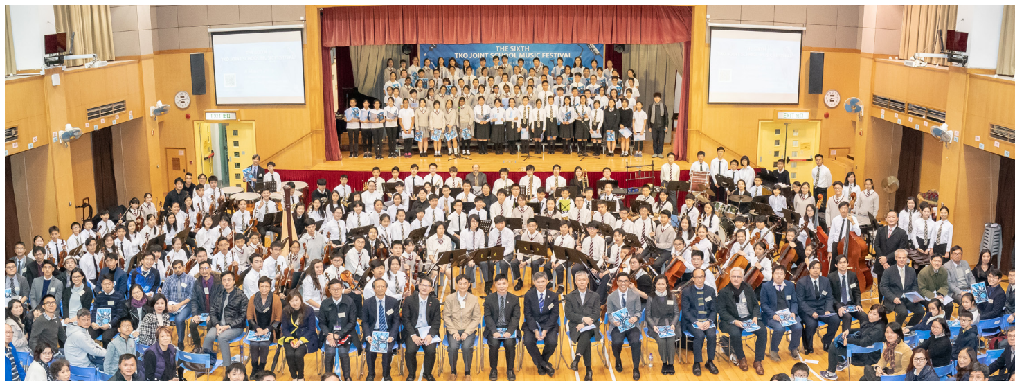
All performers and guests