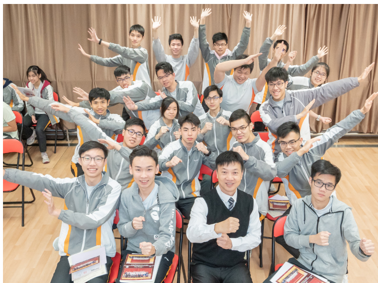
12C and Principal TAM showing off their kung fu