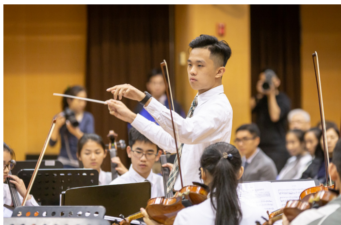
"In a Persian Market" performed by G.T. Orchestra (conductor: 11C Skye Chor)