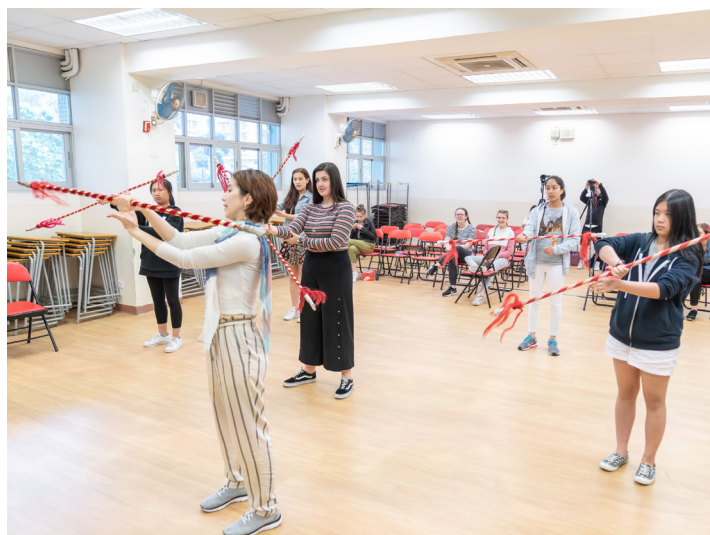
Waving that spear is just so easy; every girl can become Mulan