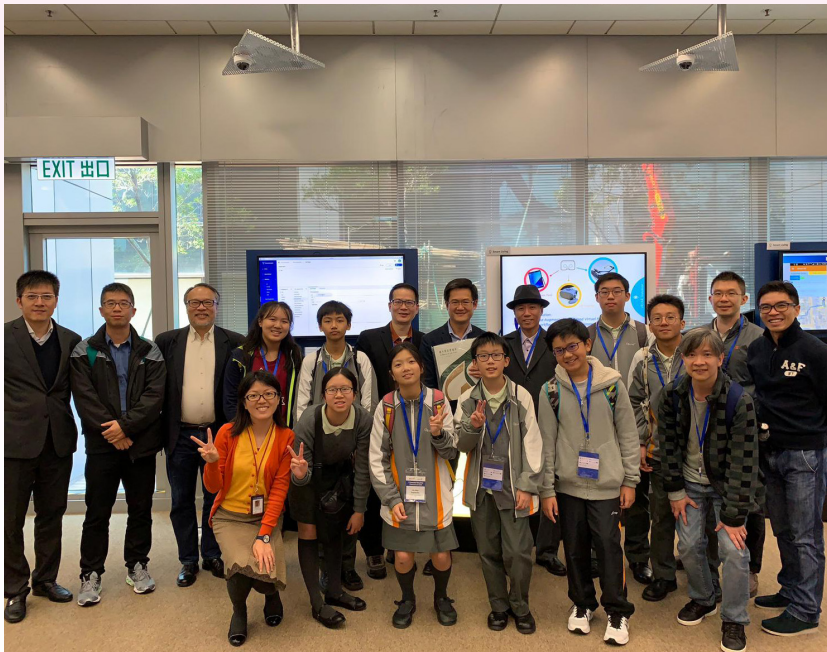
5G & IoT Exhibition Room at Block 2E building at Science Park

Since there was a special school holiday on 11 March 2019, six teachers and nine students from Grade 7 to Grade 11 attended the “5G & IoT” forum at Science Park. It was about the 5G wireless network technologies and the related Internet of Things (IoT) which are to be implemented in Hong Kong a few years later. A lot of experts in the field, called “operators,” showed up in the forum. We got the first-hand news and felt excited in this matter. After the morning session of the forum, we were honoured to visit ASTRI STEM exhibition room. The experts showed us the advanced technologies related to IoT, big data, and artificial intelligence (AI). Thanks to ASTRI officers and GT parents for organizing the visit. We had a wonderful day of experience, broadening our knowledge.