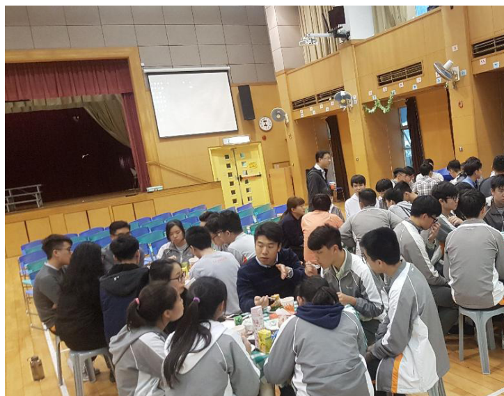
Group sharing session by alumni and teachers