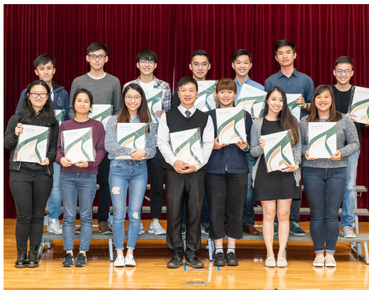
Principal TAM presenting souvenirs to alumni