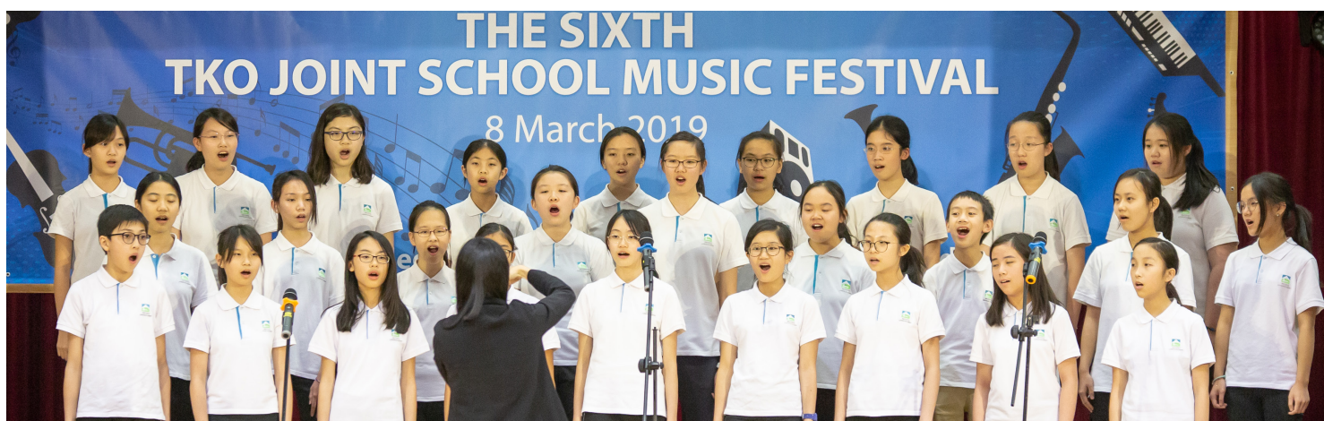
"Far Away" and "The Water is Wide" performed by Logos Choir