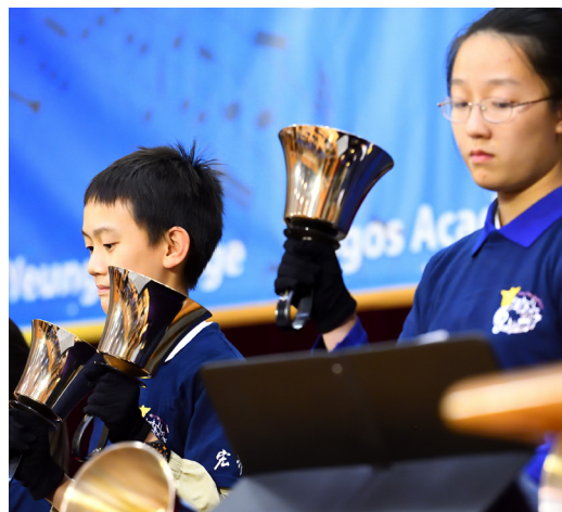
"Grazioso" performed by Logos Handbells