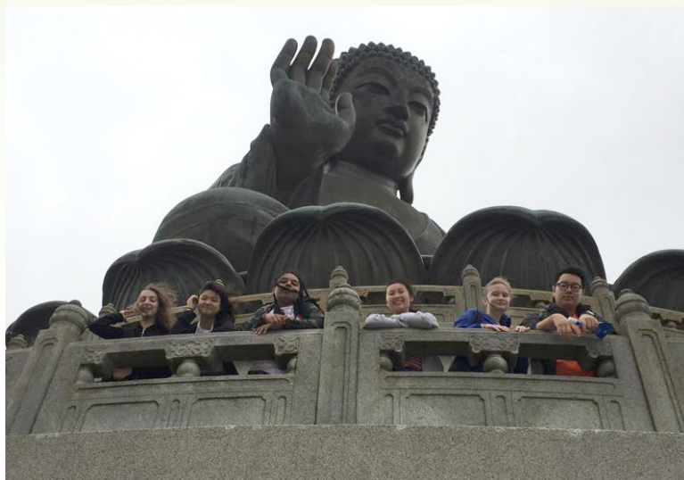
May the Buddha's thoughts be with you!

The weekend of our exchange programmes can be equally exhilarating. Bracing the onshore wind, the Ngong Ping cable cars swung the exchange students through the mist on their pilgrimage to the Big Buddha on an early Saturday morning. Our Sunday excursion to Macau, a former Portuguese colonial enclave, was made no less fun by the drizzle with a walk along the UNESCO Cultural Heritage Sites. Last but not least, we bade farewell to our guests by leaving them with a cherishable memory of trying on costumes, brandishing weapons, and reciting lines in a Cantonese opera taster, which is one of our new attempts of the year.