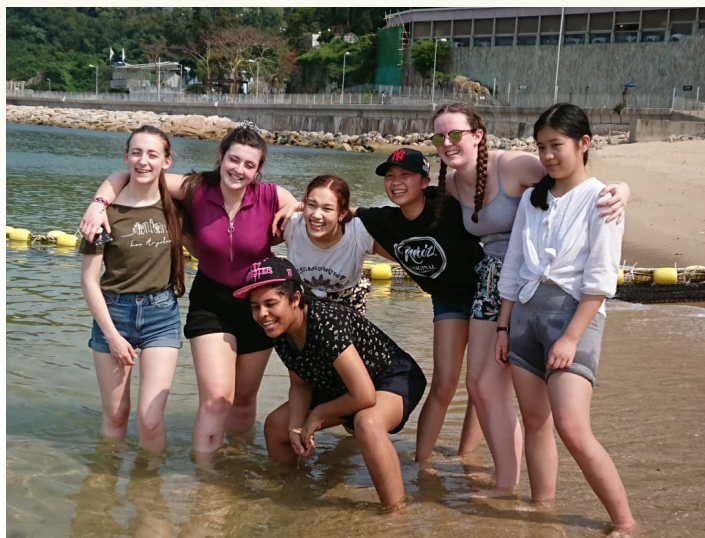
How nice is it to be on a beach with bright sunshine?