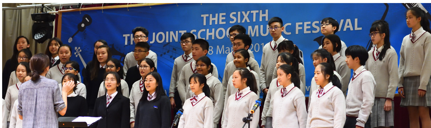
"Another Day of Sun" and "This is me" performed by C.S.S. Vocal Ensemble