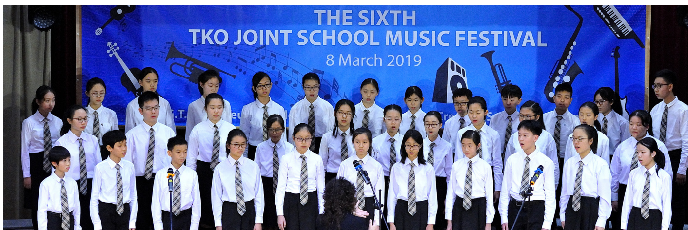
"Beauty and the Beast" and "Luna" performed by G.T. Choir and A Cappella