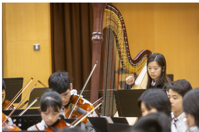
"On Top of the World" performed by C.S.S. Orchestra