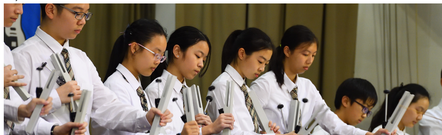
"Jubilant Celebration" and "Meditation No. 9" performed by G.T. Handchimes