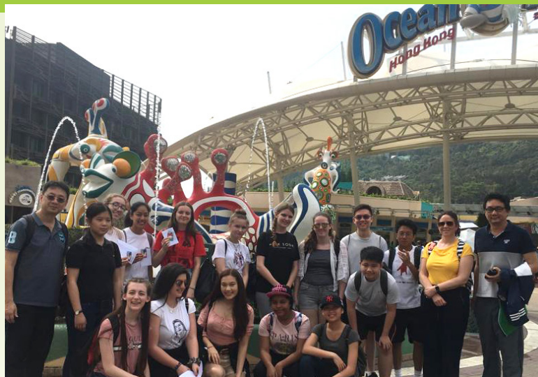
Students having a fun day at Ocean Park, riding on roller coasters while knowing more about marine life