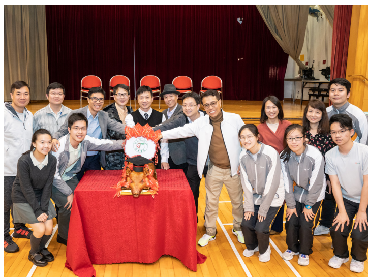
Roasted pig cutting ceremony conducted by school management, class teachers, and student representatives