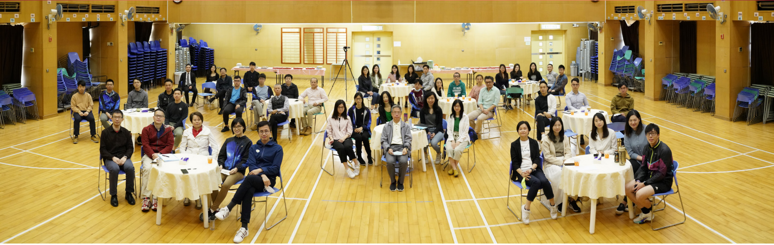
All the smiles marking the end of the teacher training program

G.T. College has long been recognized as an institution with a unique Multiple Intelligence (MI) curriculum, experienced teaching staff and talented students. Aiming to foster the core values of our school and to support the professional development of our teachers, a five-month training program has been organized to spell out G.T.'s transformation and to inspire with a mission. Gathering teachers from both primary and secondary sections, the program involves lectures from the senior management team, group discussions on G.T.'s small class teaching arrangement, and research on how MI brings benefits to students' learning. All teachers enjoy their mornings with invaluable insights from their peers and cherish the opportunity to put forward their thoughts with the guidance from their mentors through project-based research.