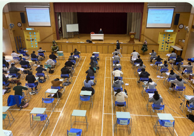
Students concentrating on tackling the challenges