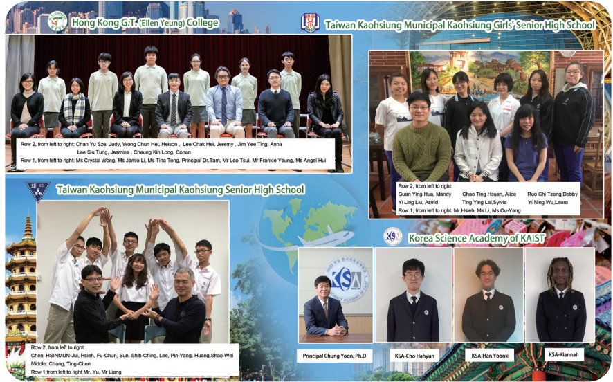
All participants smiling radiantly for lively group photos – a creative way to reach out to one another despite the distance imposed by the pandemic