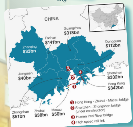
Cities in the Greater Bay Area and their respective GDP values