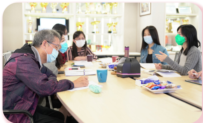
The Reading Club meeting every month to explore the use of MI in the classroom

Readers, whoever you are, you're most welcome to join us! We meet on the last good Friday of the month. Stay tuned.