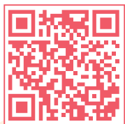
[QR1] 李卓亨(5B) 與老婆色士風在侏儸 紀世界的邂逅