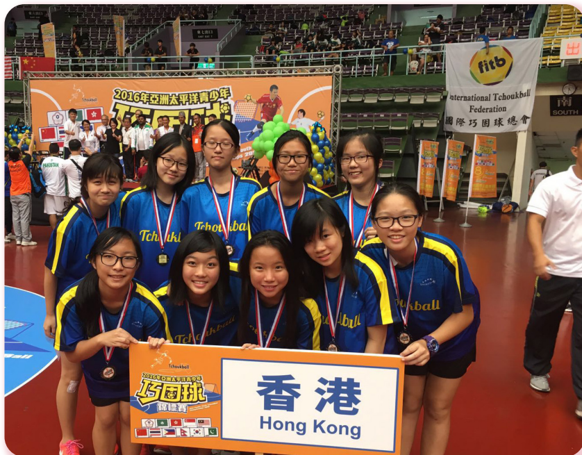
Our girls' tchoukball team being awarded the 5th place in the Asia Pacific Youth TchoukBall Championship 2016 which was held in Chinese Taipei