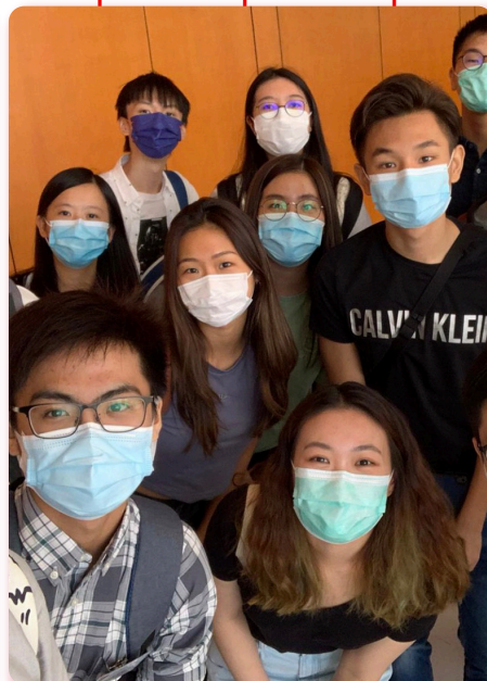
Enjoying a balanced university life!