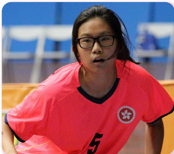
Having received an offer from CUHK, she is now pursuing Bachelor's degrees in medicine and surgery

Similar to others, pursuing my studies was what I considered important during my secondary school years. While some students can put all their effort into revising and be the 'hard-working high achiever', I definitely don't belong to that category. To diversify my learning experience at GT College, I joined the school handball team and also other sports teams. My teammates and I had regular practices weekly after school, where our teamwork and specific drills were trained. It wasn't easy, but I had a great time with my teammates after each training session. The most rewarding part would be to compete against other teams with my teammates after extra hours of practice, and how our team spirit empowered us throughout the matches. Being part of the sports team in my secondary school journey not only allowed me to be friends with such supportive teammates but also helped me to achieve my study-life balance, hence motivating me to achieve better academically.