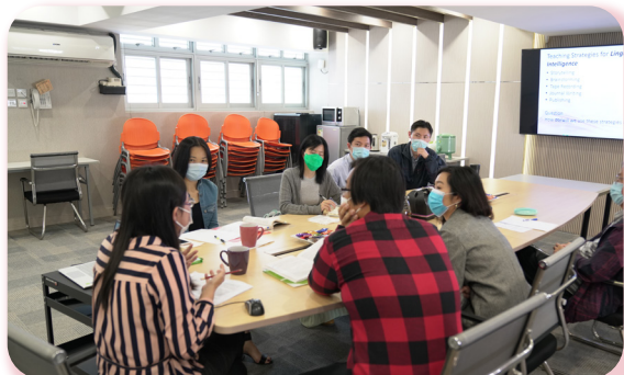
Members of the GT Reading Club actively participating in discussion