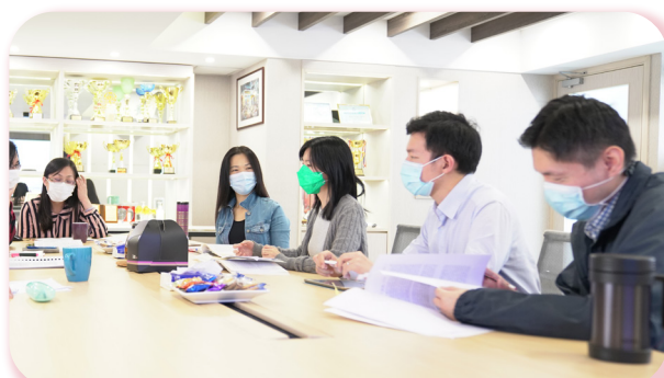
Utilizing all of our intelligences and embracing our weaknesses for the sake of students at GT