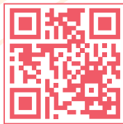
[QR4] 羅凱晴(5C)的 ABRSM敲擊樂五級公開考 試中哪一首只學了2個月