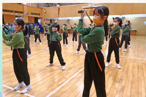
▲ G6 學生齊齊參與中學體驗日，嘗管耍雙節棍的樂趣