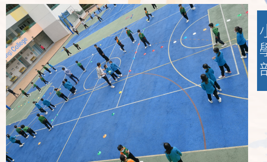
▲ 由活動組老師帶領下，G4全級學生進行班際閃避球比賽，大家不忘保持社交距離