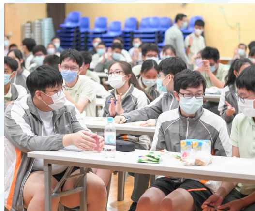
Students cheering for the outstanding IB results of 2020 IB examinations