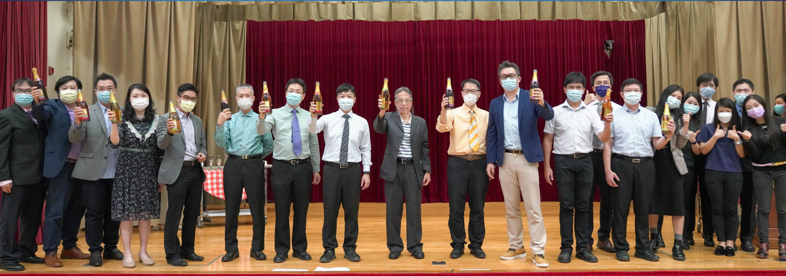
The school management team and IB teachers proposing a toast to the success of our IB celebration!