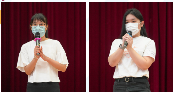
Student representatives sharing their learning experiences on stage