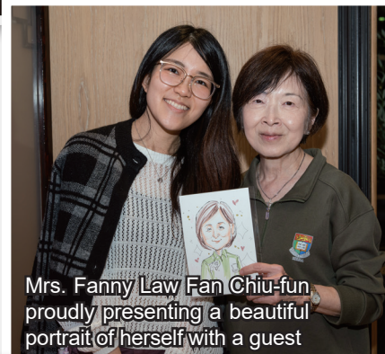
Mrs. Fanny Law Fan Chiu-fun proudly presenting a beautiful portrait of herself with a guest

Adding further inspiration, renowned educator Mrs. Fanny Law Fan Chiu-fun shared her thoughtful reflections on education and future possibilities. Amid lively conversations and heartfelt exchanges, the evening became a truly mesmerising and unforgettable gathering.