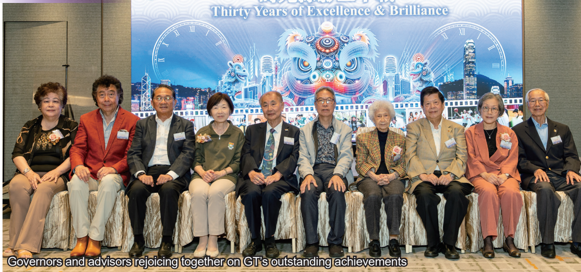
Governors and advisors rejoicing together on GT's outstanding achievements