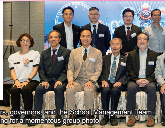
Advisors, governors, and the School Management Team gathering for a momentous group photo