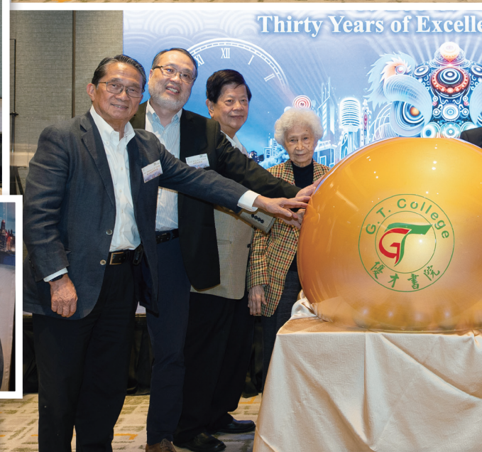
Governors and advisors gracing the stage to kickstart the Annual Advisors' Dinner