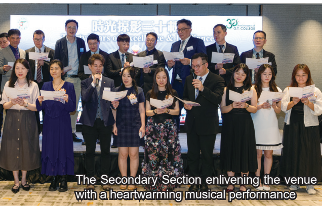
The Secondary Section enlivening the venue with a heartwarming musical performance

Adding further inspiration, renowned educator Mrs. Fanny Law Fan Chiu-fun shared her thoughtful reflections on education and future possibilities. Amid lively conversations and heartfelt exchanges, the evening became a truly mesmerising and unforgettable gathering.