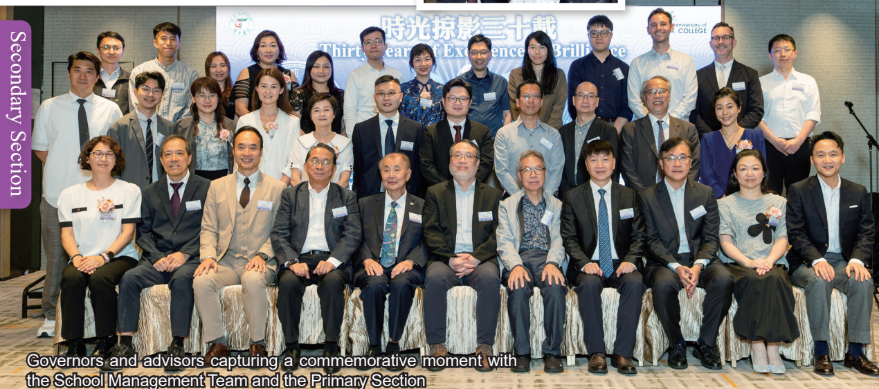
Governors and advisors capturing a commemorative moment with the School Management Team and the Primary Section