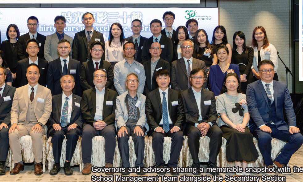
Governors and advisors sharing a memorable snapshot with the School Management Team alongside the Secondary Section