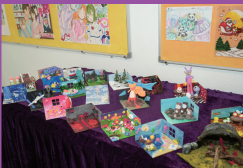
Incredible art created by our talented students being displayed in the corridor

Diving into Term 3, the transition is always a vital moment for our students to look back at their hard work and start mapping out their goals for the rest of the school year. To help guide them on this journey, we held our Term 2 Parents' Day on 18 April, 2026. On that day, class teachers and parents sat down to share their mutual appreciation and support for our students. At the same time, our senior teachers and the dedicated Moral Education Group (MEG) met with families to provide tailored guidance and extra care for students who needed a bit of a boost this term.