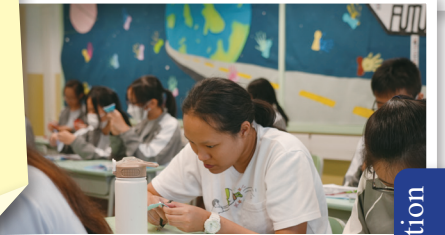
A KVIS student figuring out the art of Chinese paper cutting at Elective Day