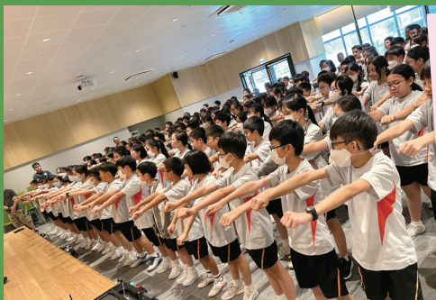
G.T. students partaking warm up exercises early in the morning

In the game, at first, we finished in 30 seconds. It's quite a long time in finishing this game. After that, we thought of a faster way. Then, we trained for several times. At last, we finished in 10 seconds. I was moved at that moment because I saw all of us were sticking together to achieve a goal. After this activity, everyone smiled. Then I learnt that we should encourage others, observe other's good points and learn from them. Also, I learnt that we should listen to others.