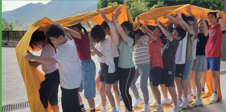
Students working together rolling the Caterpillar Thread

On 18th-19th Sep 2023, our G7 students and class teachers went to an overnight camp at Duke of Edinburgh Training Camp. Students participated in a series of discipline training, team-building activities and adventure challenges such as Ping Pong Rolling, Rolling the Big Tyre and Night Walk. They learned how to cooperate in a team. Also, they had a lot of unforgettable memories with classmates and teachers.