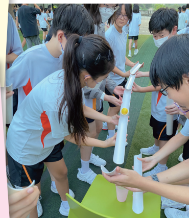
A group of students displaying concentration and diligence on Ping Pong Ball Rolling