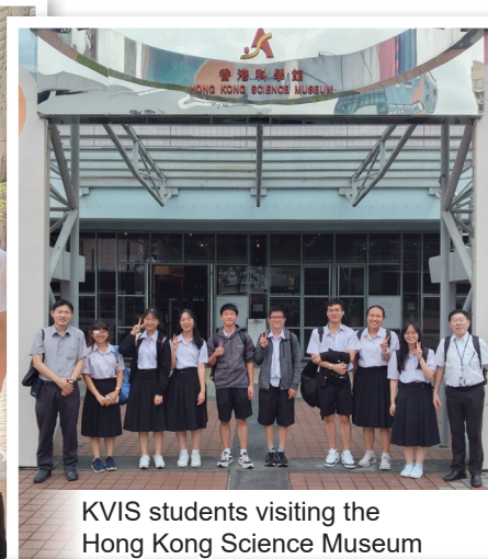
KVIS students visiting the Hong Kong Science Museum