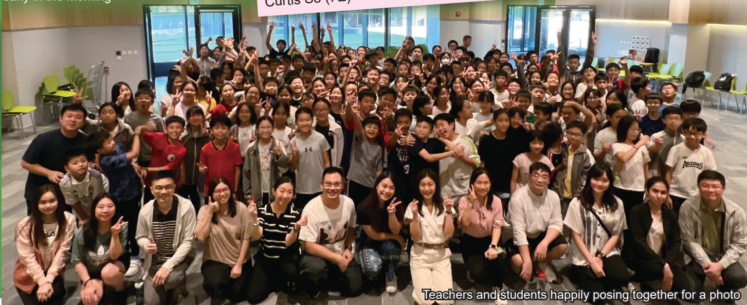
Teachers and students happily posing together for a photo