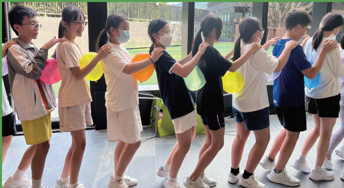
Students linking like train cars by using balloons