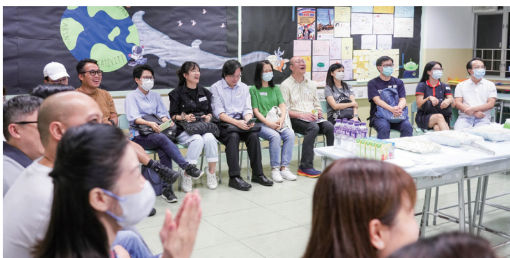
Parents commenting on their children's fruitful learning progress at G.T.