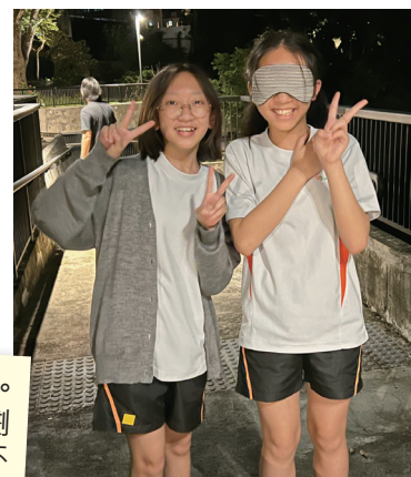
Students posing for a photo during the Night Walk and Game of Trust