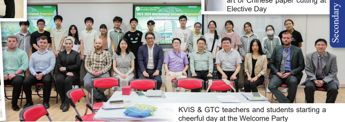
KVIS & GTC teachers and students starting a cheerful day at the Welcome Party