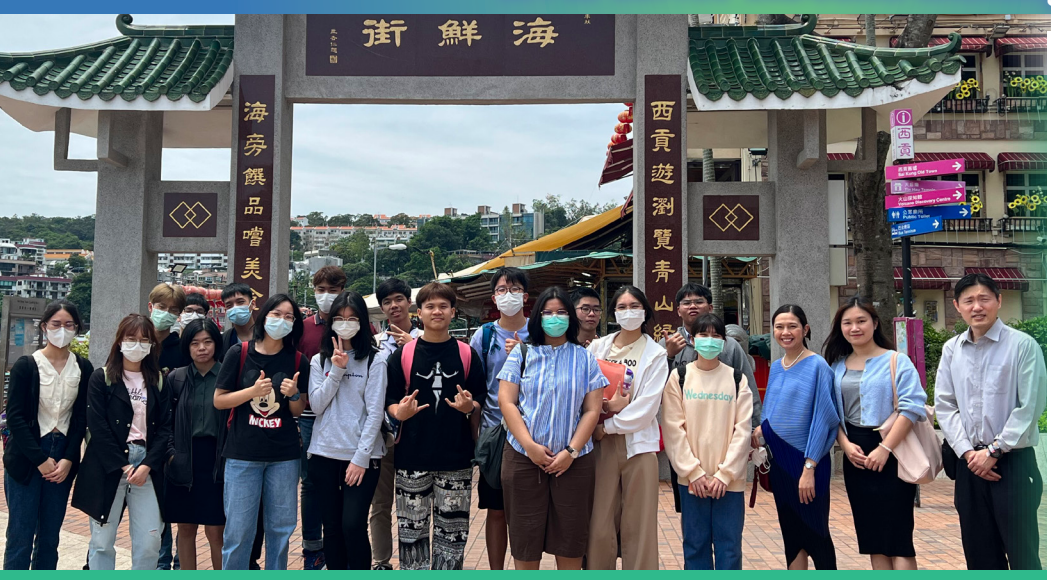
KVIS and MWIT teachers and students taking a photo at Sai Kung area

We really enjoyed the inbound exchange with KVIS and MWIT students. The teachers were extremely kind and displayed a keen interest in getting to know how our school works and what makes it special. We discussed our unique school culture and commitment to excellence.