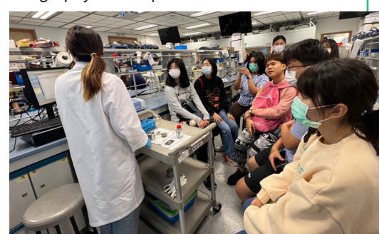
MWIT students observing the Chemistry experiment at a Chemistry lab at HKUST