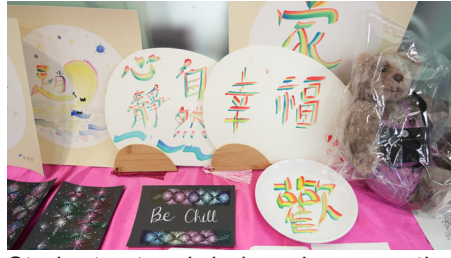
Family albums by G7 students being Student artwork being shown on the ground floor