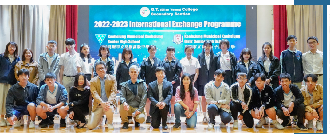
All the participants taking a memorable photo in the school assembly