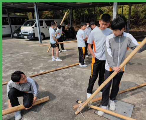
G8 students building the catapult together