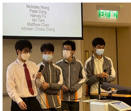
GT students and their teammate presenting their project