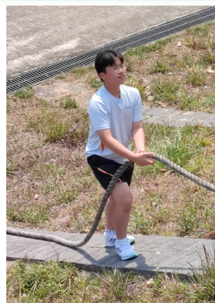
Climbing the slope is not easy!