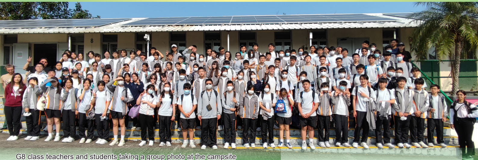
G8 class teachers and students taking a group photo at the campsite