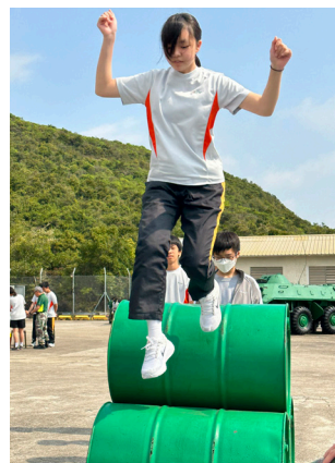
Great challenge overcome!

Form 10th-11th March 2023, our G8 students and class teachers went for an overnight camp at Sai Kung Man Yee Training Camp. Led by trainers of the Hong Kong Adventure Corps, students participated in a series of challenging activities such as abseiling, foot drilling, catapulting and night walking. They made a lot of unforgettable memories, especially after a long halt of outdoor activities under the pandemic.