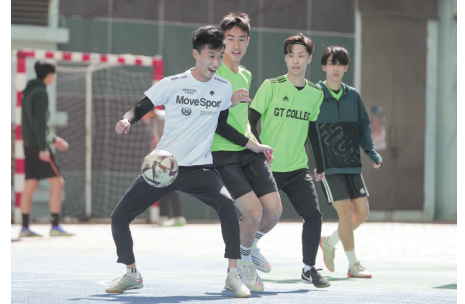
Alumni securing a glorious takeover in the football competition