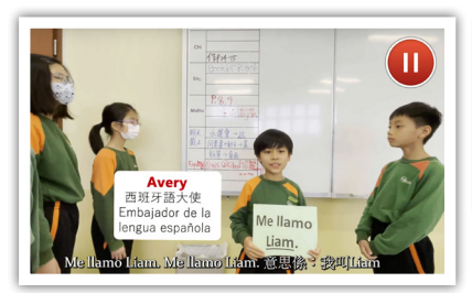
▲ Screenshot from Spanish Talent Class Video "Un español sospechoso'