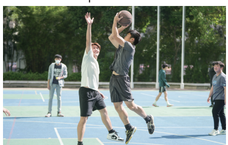
Alumni playing their all-time favourite sports: basketball