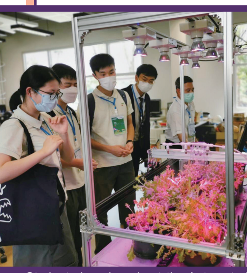
Students learning about the Automated Irrigation System (made by KVIS students) from a local teacher