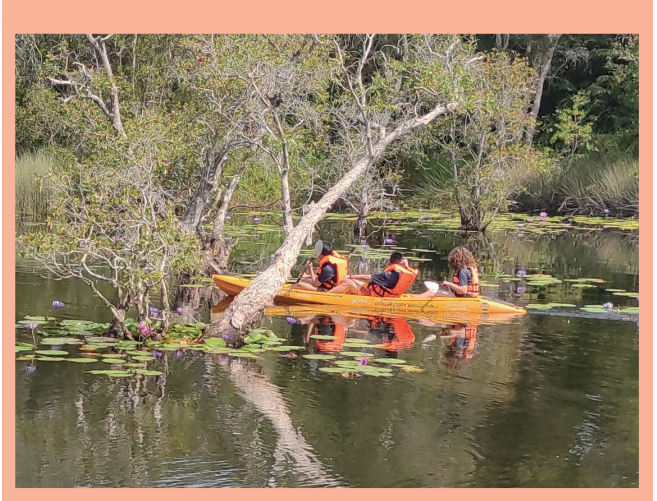
Students on an excursion to the Rayong Botanic Garden, kayaking to sightsee Rayong's wetland ecology