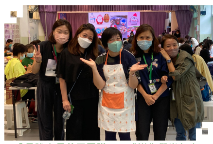
▲「最強家長義工團隊」! 感謝你們半年來 的並肩同行,讓愛傳出去!