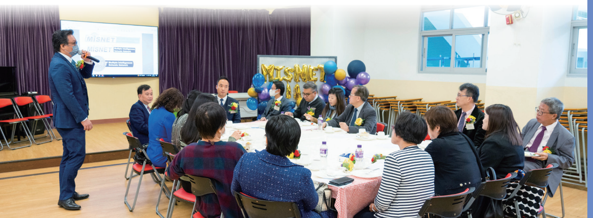
MISNET founders and G.T. leaders engaging in discussion