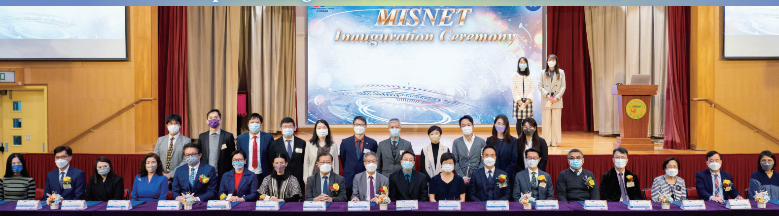
Founding members of MISNET and G.T. teachers attending the signing ceremony

Multiple Intelligences Schools Network (MISNET)