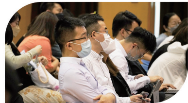
▲講者見解精闢；聽眾聚精會神