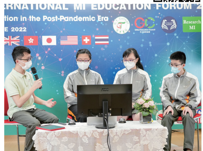
Student representatives sharing their learning experiences in the past two years