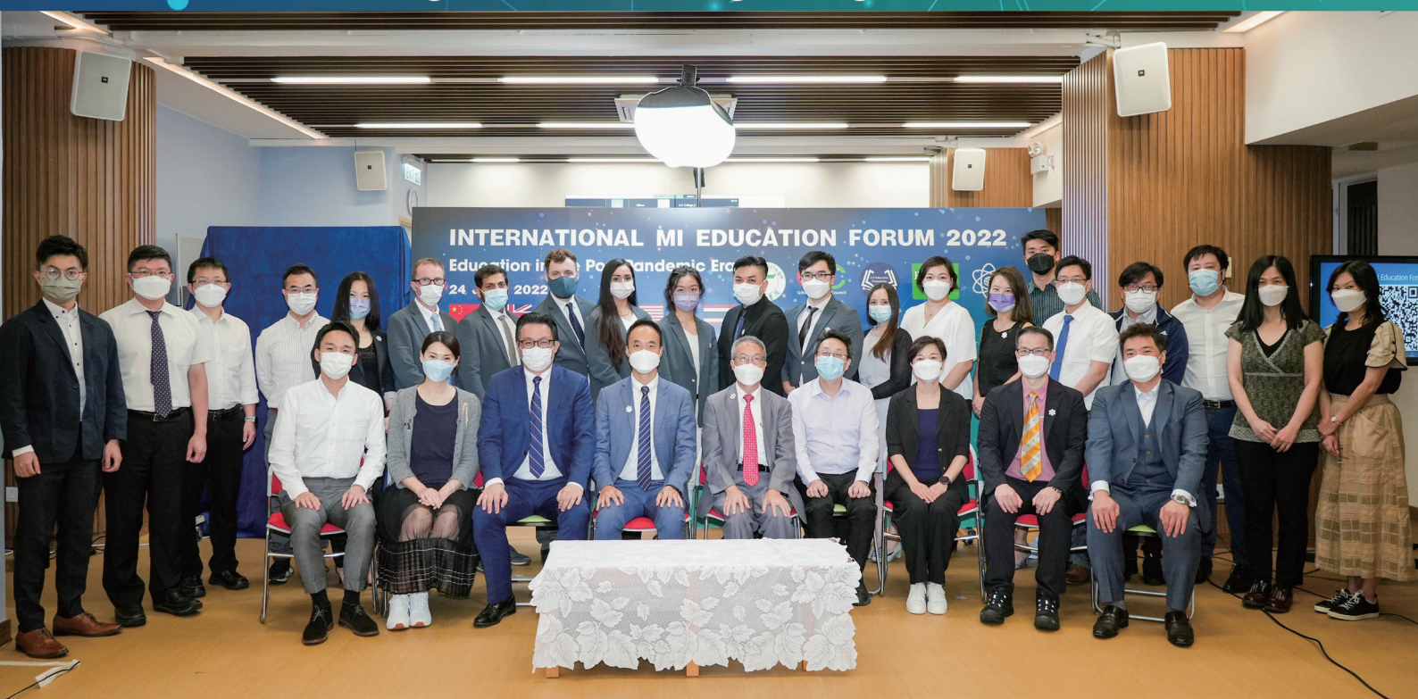
The Organizing Committee of International MI Education Forum 2022